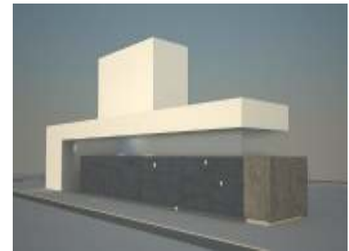
Future look of the Nano-science center in Belgrade (2013)