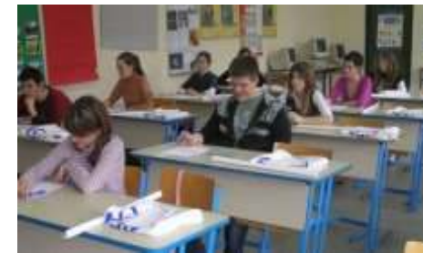
Education reform at all levels