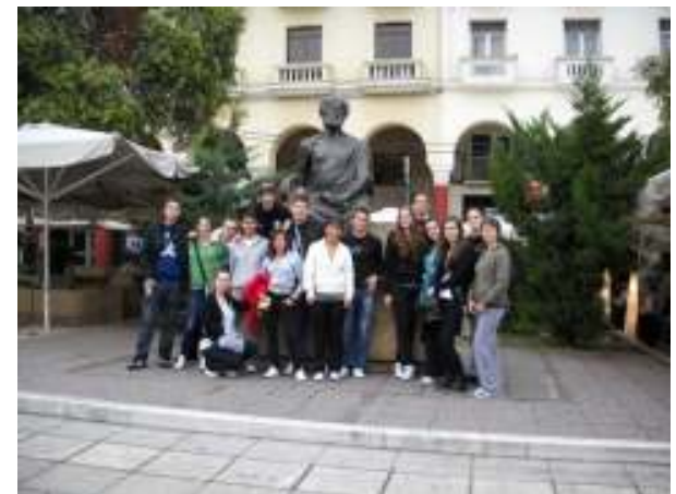
The best students from the least developed areas of Serbia traveled to Thessaloniki, 5-9 October 2010