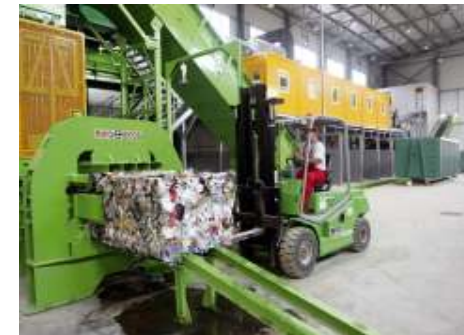
180 million euros invested in key infrastructure