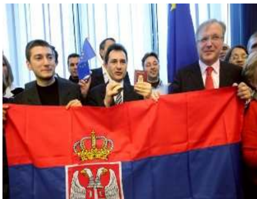
50 citizens picked for their accomplishments traveled to 4 European countries – France, Italy, Belgium and Germany on the occasion of introducing a visa-free regime for Serbia, 18-27 December 2009