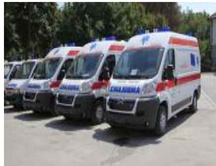
200 emergency hospital vehicles purchased