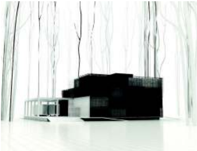
Future look of the University of Novi Sad Central building (Spring 2012)