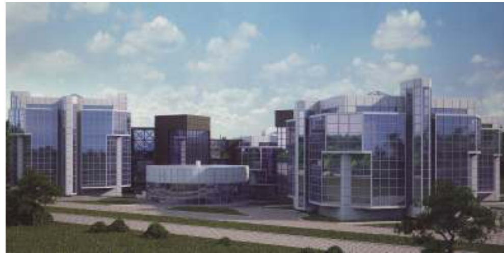
Future look of the Zvezdara Science and Technology Park (Spring 2012)