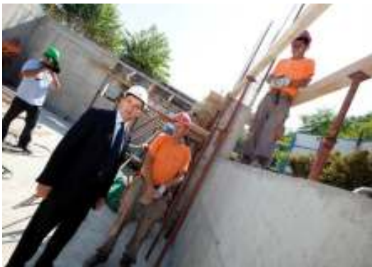
Visiting the construction site of the Petnica Research Center (Spring 2012)