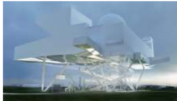
Design of the Science promotion center in Belgrade (2014)