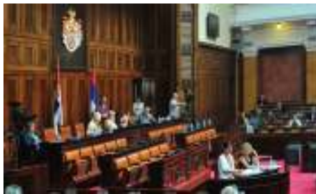
Public administration reform and harmonization with EU aquis communautaire