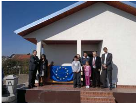
29 million euros for solving housing problems of refugees