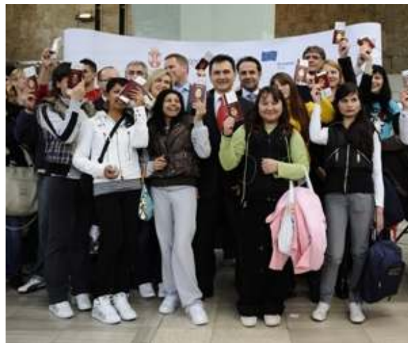
Children without parents traveled to Austria, 6-10 April 2010